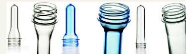
Technical Data 参数表